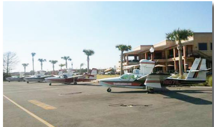
February 21, 2011 brought in so many seaplanes - more than the City of Tavares has seen in a while; filling up the ramp, restaurants and gift store.