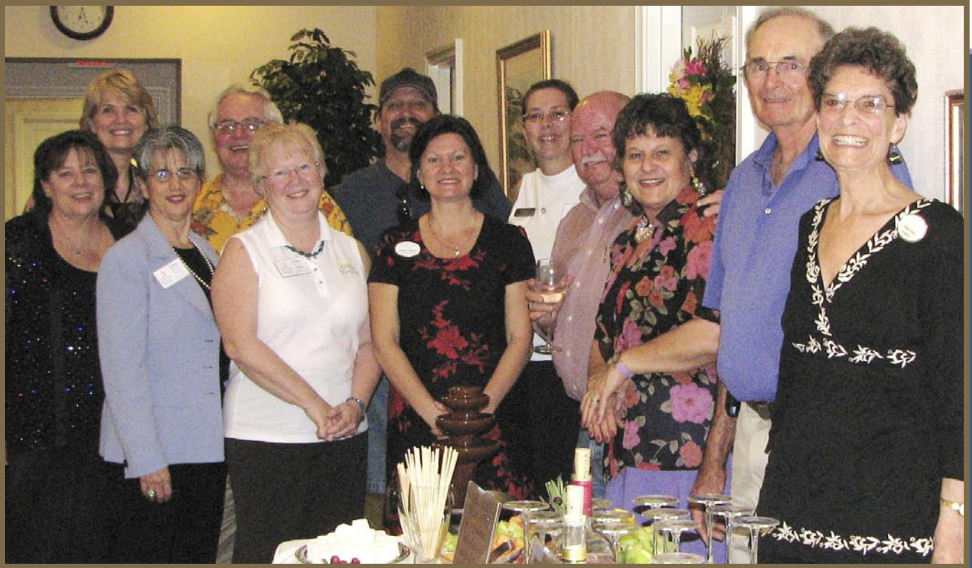
Sterling House Business After Hours February 24, 2011

Tavares Chamber of Commerce 912 North Sinclair Avenue Tavares, FL 32778