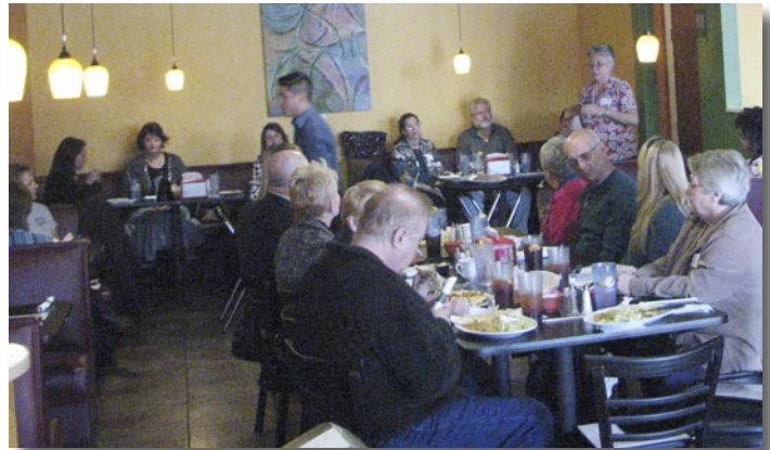
February 8, 2011 Networking Lunch at La Yaquecita Mexican Grill