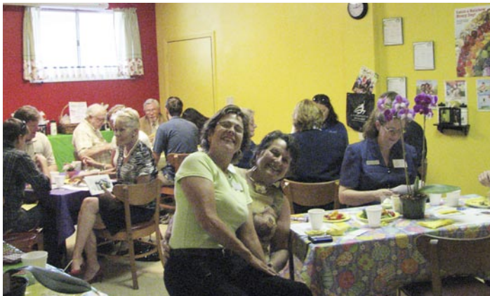
Tavares Chamber April Networking Lunch at E-Z Nutrition 101 on April 12, 2011