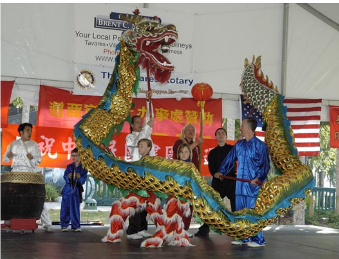
The Dragon Dance