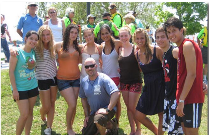
Rotary Youth Exchange Students win their Dragon Boat Division!