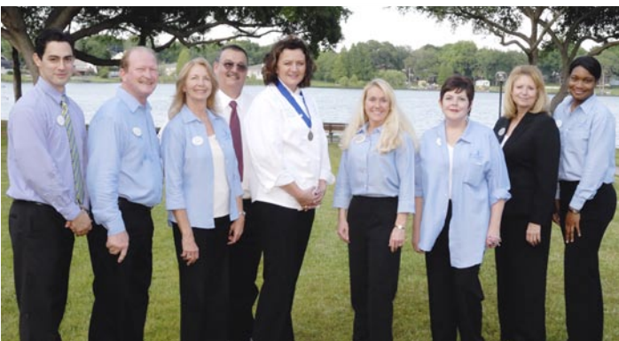
Grand Court Business After Hours on April 21, 2011